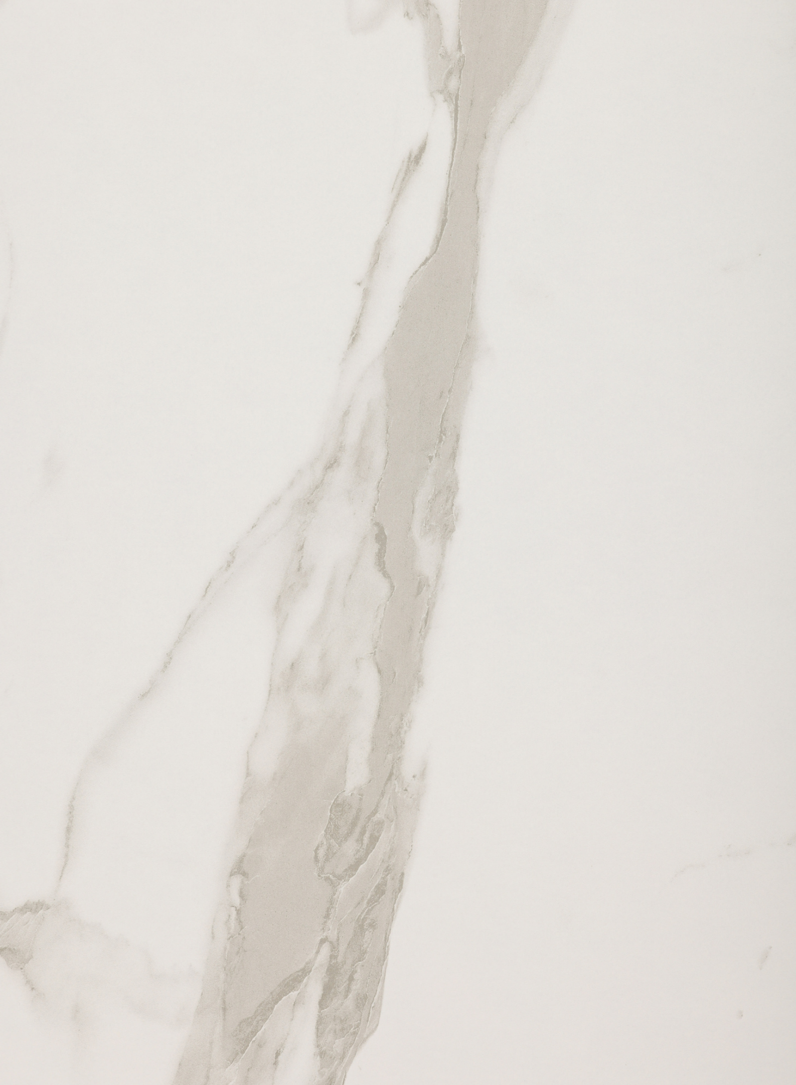
MARMO CALACATTA 037